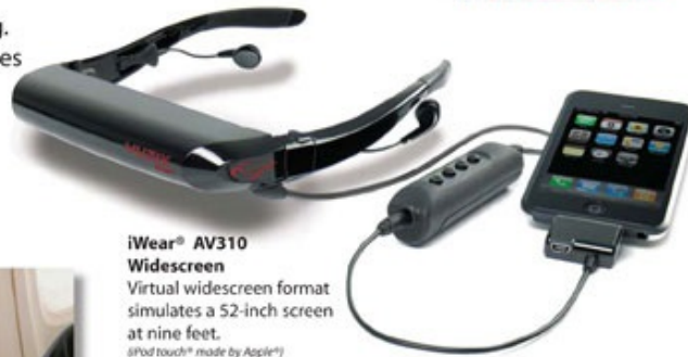
iWear® AV310 Widescreen Virtual widescreen format simulates a 52-inch screen at nine feet. (iPod touch® made by Apple®)

Video eyewear for mobile viewing. Works with all audio / video devices with composite video out including iPod® and iPhone™.