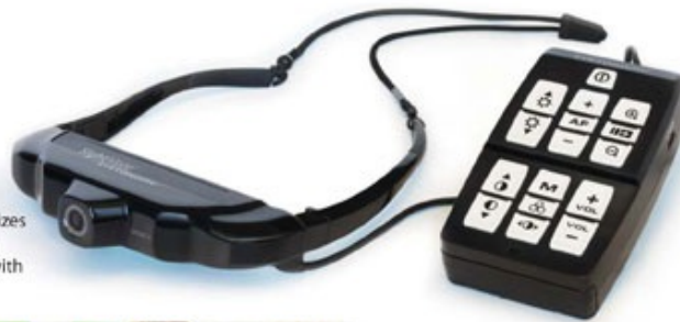
SightMate™ LV920 Video eyewear that optimizes residual peripheral vision. Designed for individuals with macular degeneration.