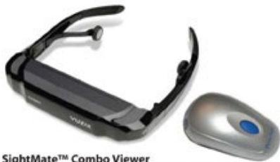
SightMate™ Combo Viewer iWear® AV920 video eyewear combined with a third-party digital mouse magnifier helps individuals with impaired vision read small print.