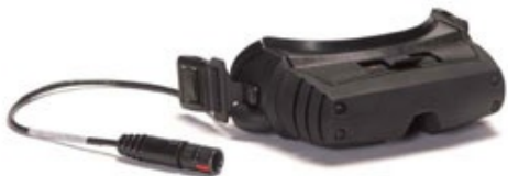
Marinized Binocular Big screen display for video/UAV/FLIR and naval applications.