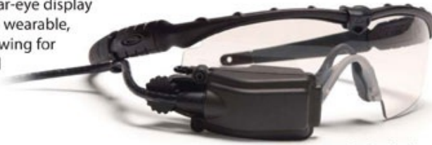
Tac-Eye Series Durable monocular head-mounted computer or video displays designed to clip onto safety glasses, headsets or safety goggles.

High-performance near-eye display solutions that provide wearable, private hands-free viewing for defense and industrial environments.