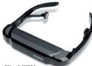
iWear® AV920 Virtual 62-inch screen viewed at nine feet.