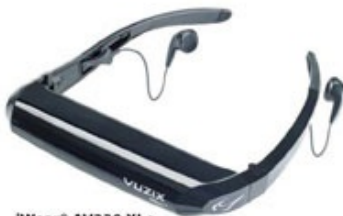
iWear® AV230 XL+ Virtual 44-inch screen viewed at nine feet.