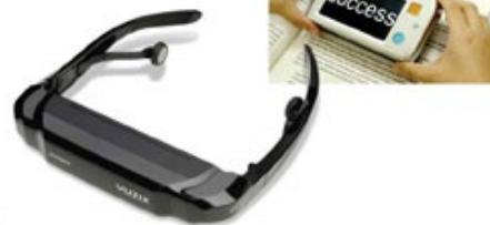
SightMate™ Freedom Viewer Combo iWear® AV920 video eyewear combined with a third-party handheld electronic magnifier helps individuals with impaired vision read small print.