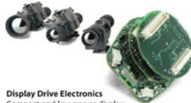
Display Drive Electronics Compact and low power display drive electronics subassemblies for integration into third party thermal sighting systems for use by defense forces.