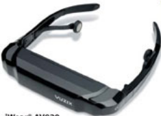
iWear® AV920 Virtual 62-inch screen viewed at nine feet.