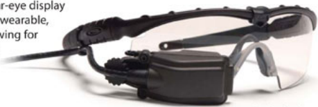
Tac-Eye Series Durable monocular head-mounted computer or video displays designed to clip onto safety glasses, headsets or safety goggles.

High-performance near-eye display solutions that provide wearable, private hands-free viewing for defense and industrial environments.