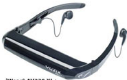
iWear® AV230 XL+ Virtual 44-inch screen viewed at nine feet.