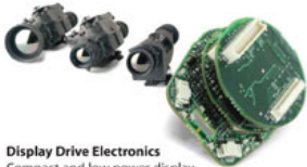
Display Drive Electronics Compact and low power display drive electronics subassemblies for integration into third party thermal sighting systems for use by defense forces.