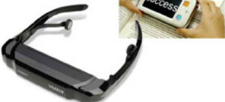
SightMate™ Freedom Viewer Combo iWear® AV920 video eyewear combined with a third-party handheld electronic magnifier helps individuals with impaired vision read small print.