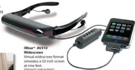
iWear® AV310 Widescreen Virtual widescreen format simulates a 52-inch screen at nine feet. (iPod touch® made by Apple®)